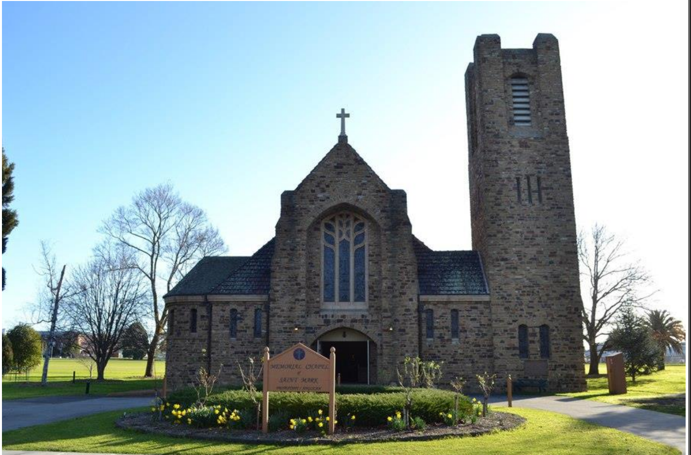
HMAS Cerberus Protestant Chapel of St Mark, Crib Point, Victoria