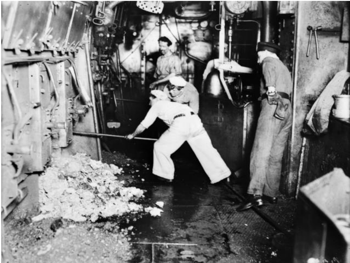
Unidentified stokers at work in the boiler room on board HMAS Australia . (Photo period 1914-1918)