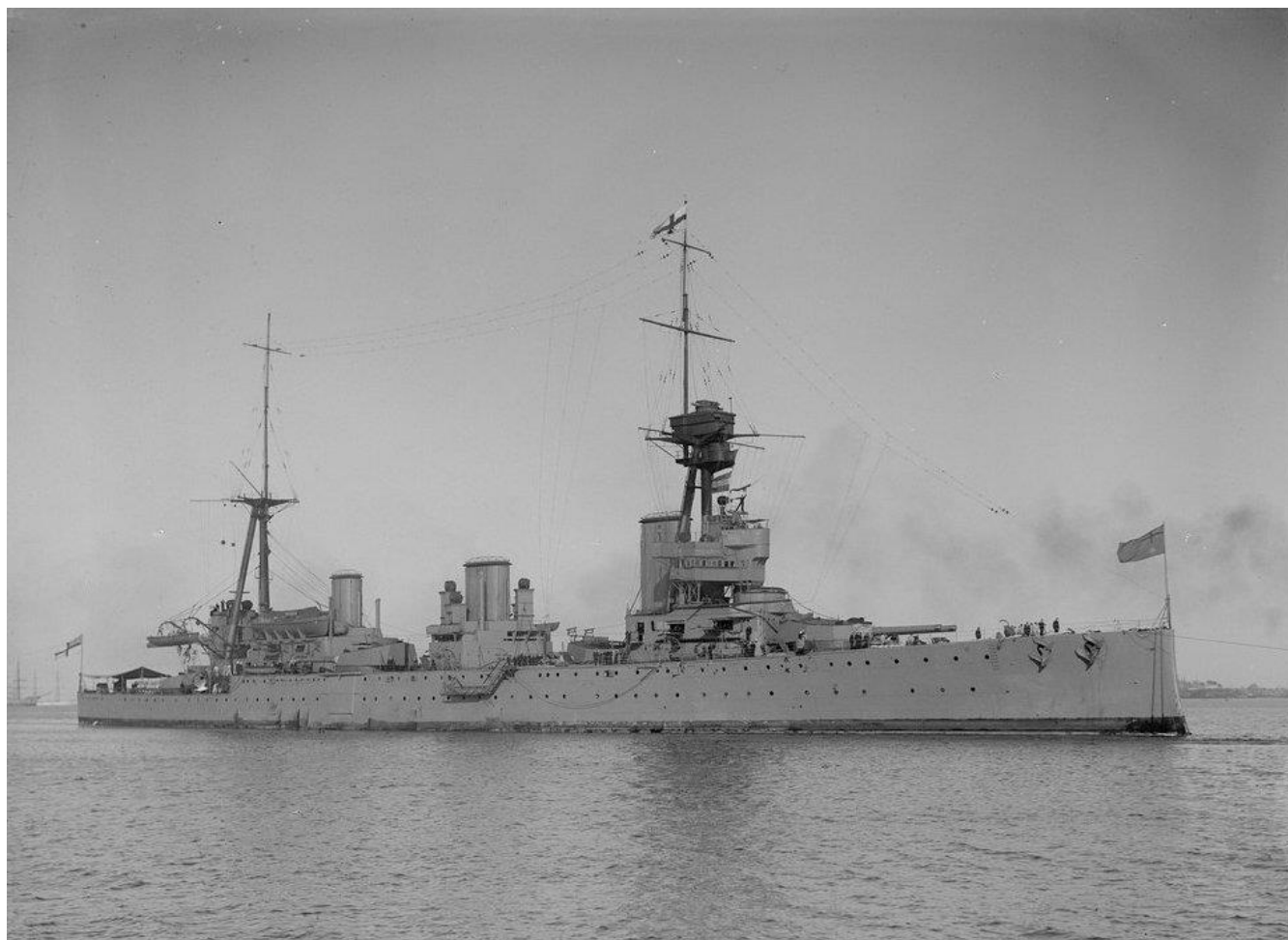
H.M.A.S. Australia 1914